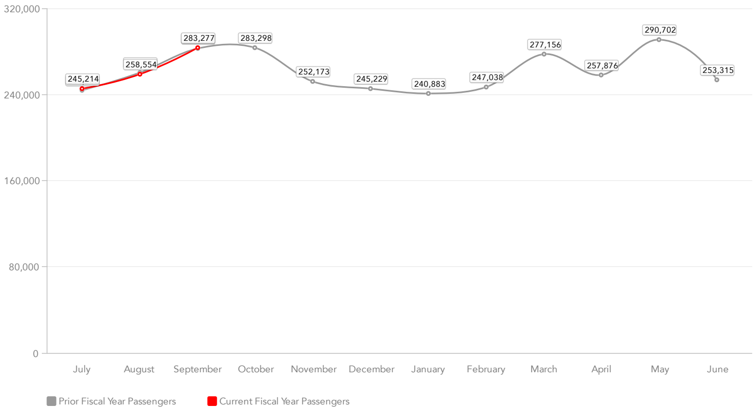
Demand Response Passengers by Month