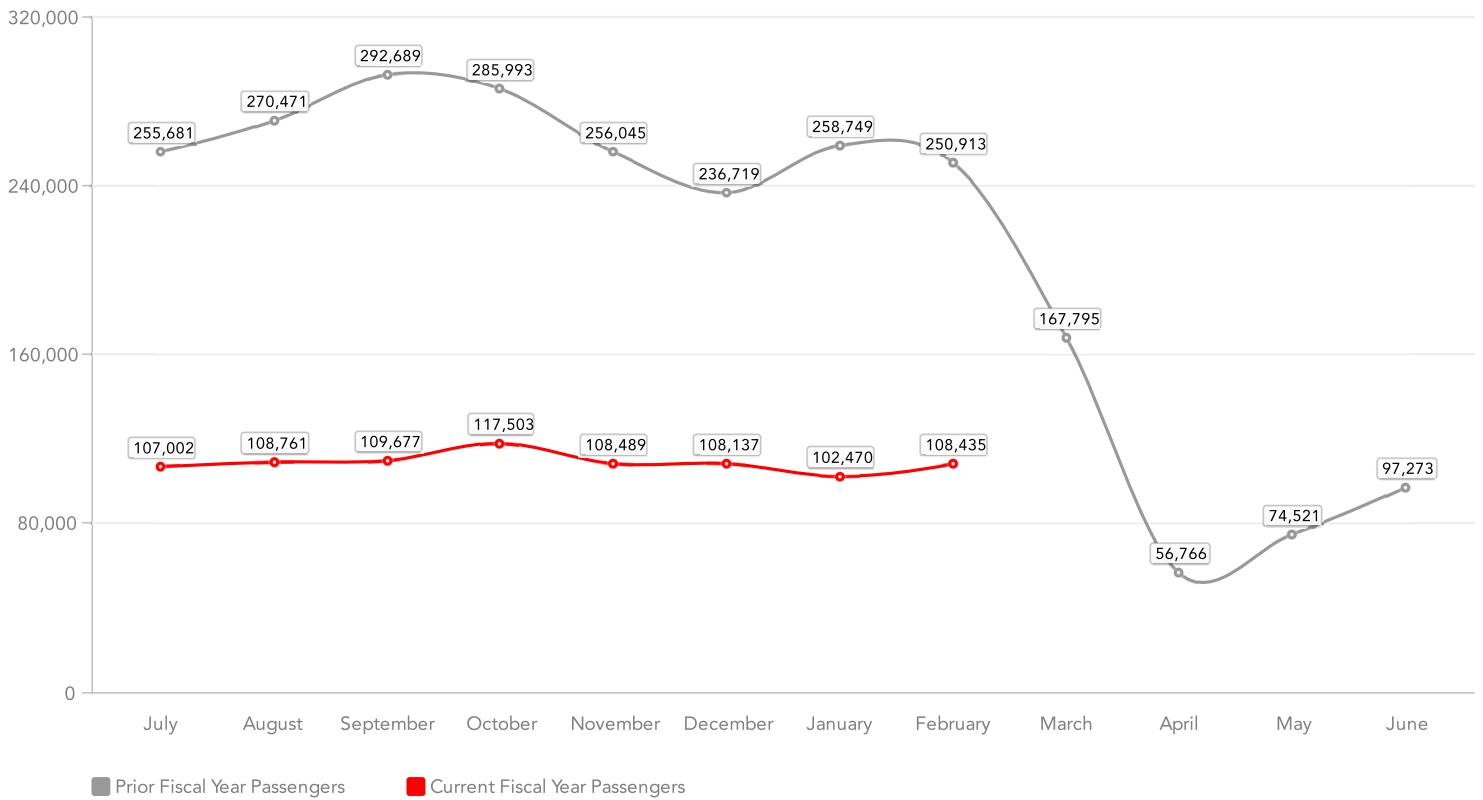
Demand Response Passengers by Month