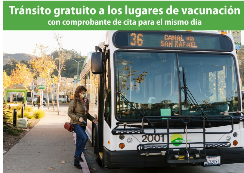
Image posted to Marin Transit social media sites on free transit to vaccination sites (Feb. 2021)

Poster displayed in Marin Transit vehicles and activity centers on promotional fare campaign offering free transit for older adults and people with disabilities (Oct. 2021).