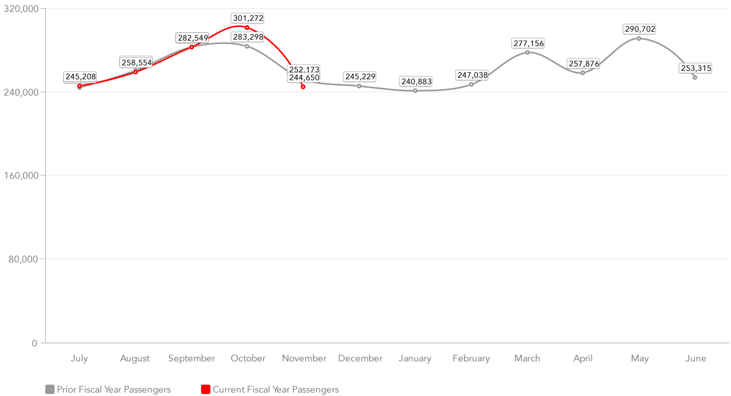
Demand Response Passengers by Month