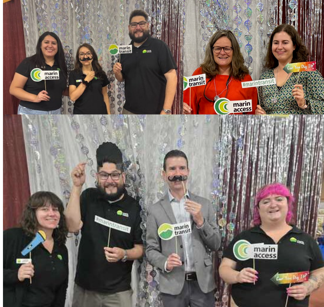
September 17 – Marin Senior Fair