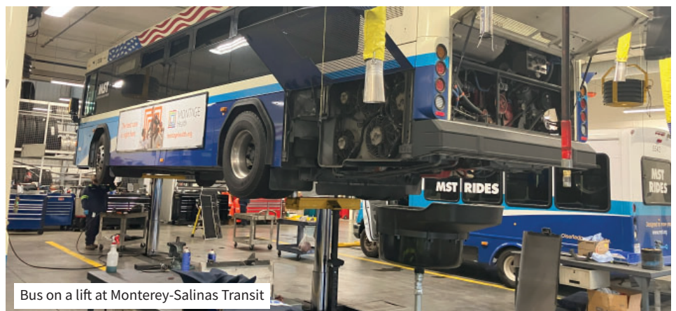
Bus on a lift at Monterey-Salinas Transit