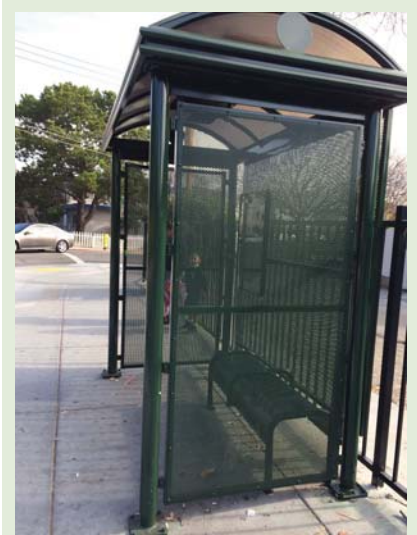
Example of shelter to be installed at several stops throughout county