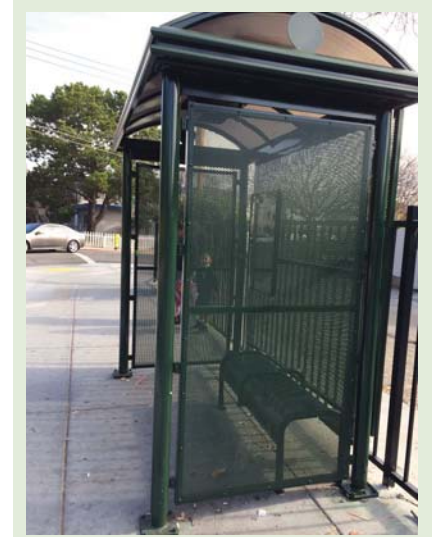
Example of shelter to be installed at Nova Albion Way and Montecillo Rd